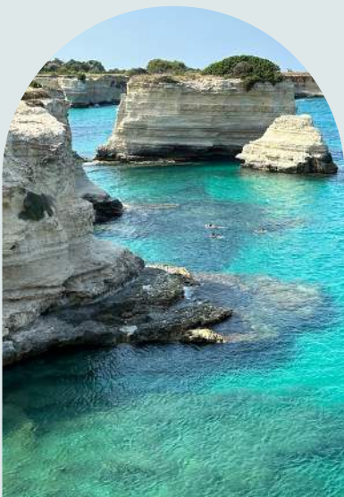
SALENTO Day 8 - 14