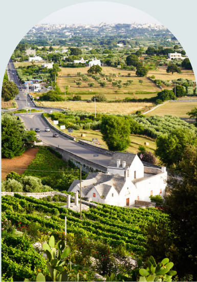
VALLE D'ITRIA & CENTRAL COAST Day 1 - 5