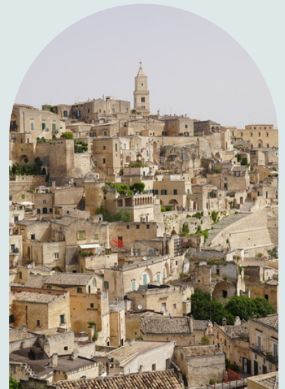
MATERA Day 6 - 7