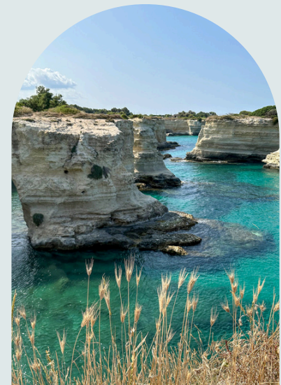
LECCE, OTRANTO, CASTRO & SANTA MARÍA DE LEUCA