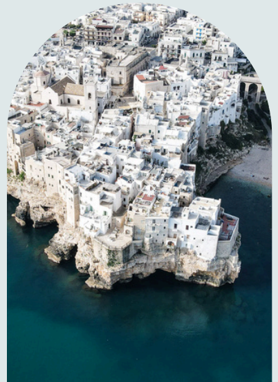
POLIGNANO A MARE, MONOPOLI, ALBEROBELLO, LOCOROTONDO, & BARI